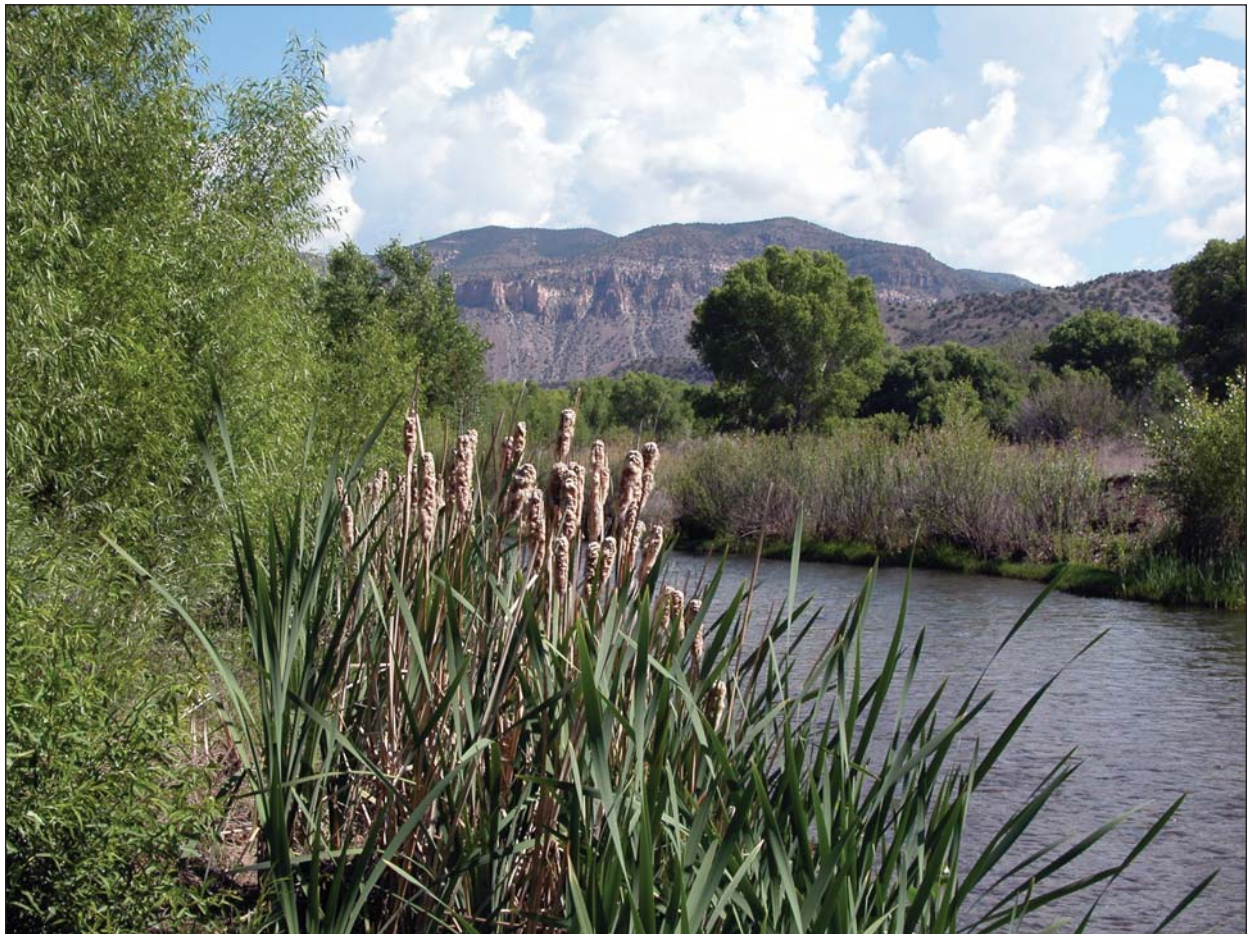
Tranquility on the Gila