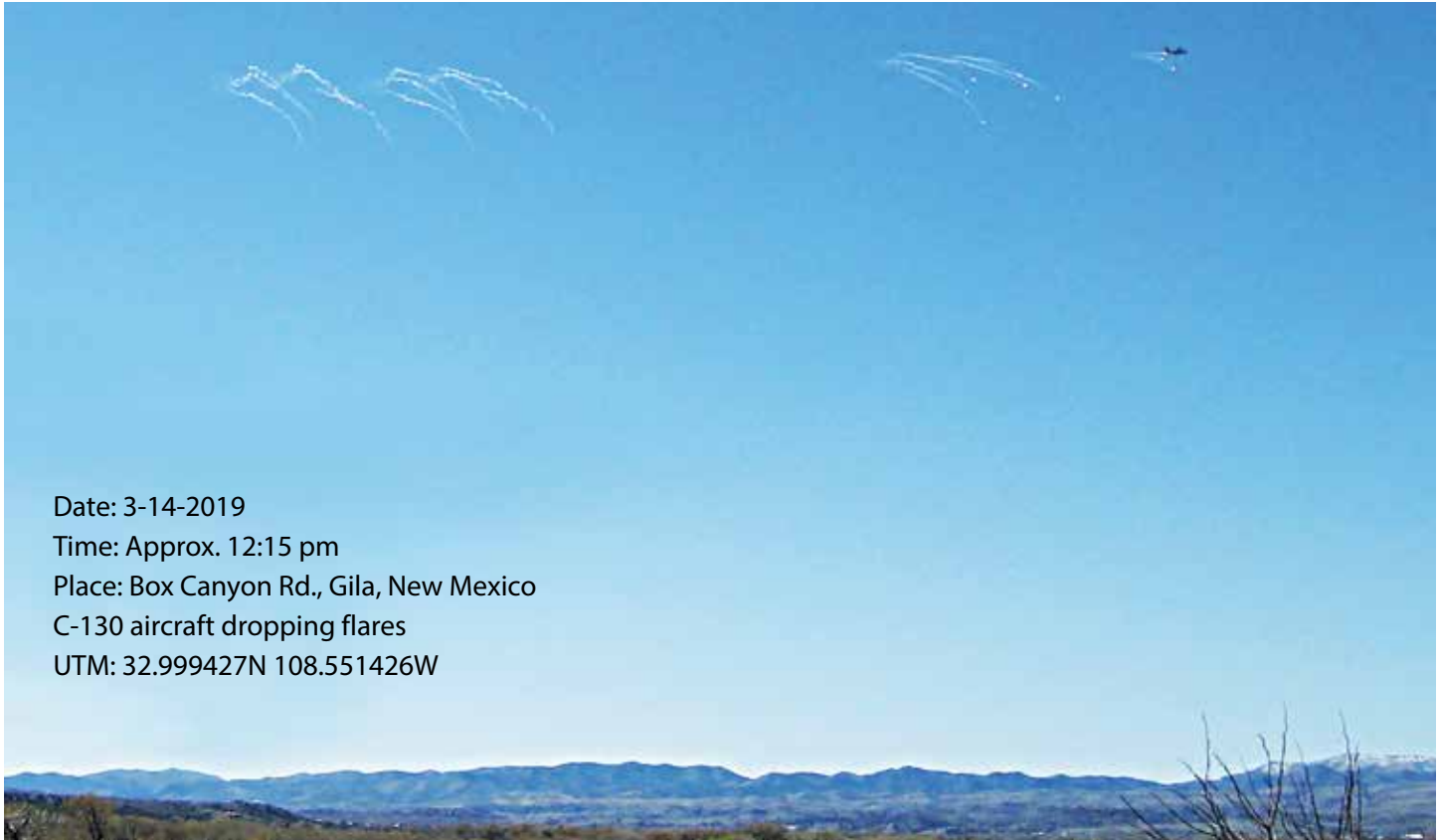
Date: 3-14-2019 Time: Approx. 12:15 pm Place: Box Canyon Rd., Gila, New Mexico C-130 aircraft dropping flares UTM: 32.999427N 108.551426W