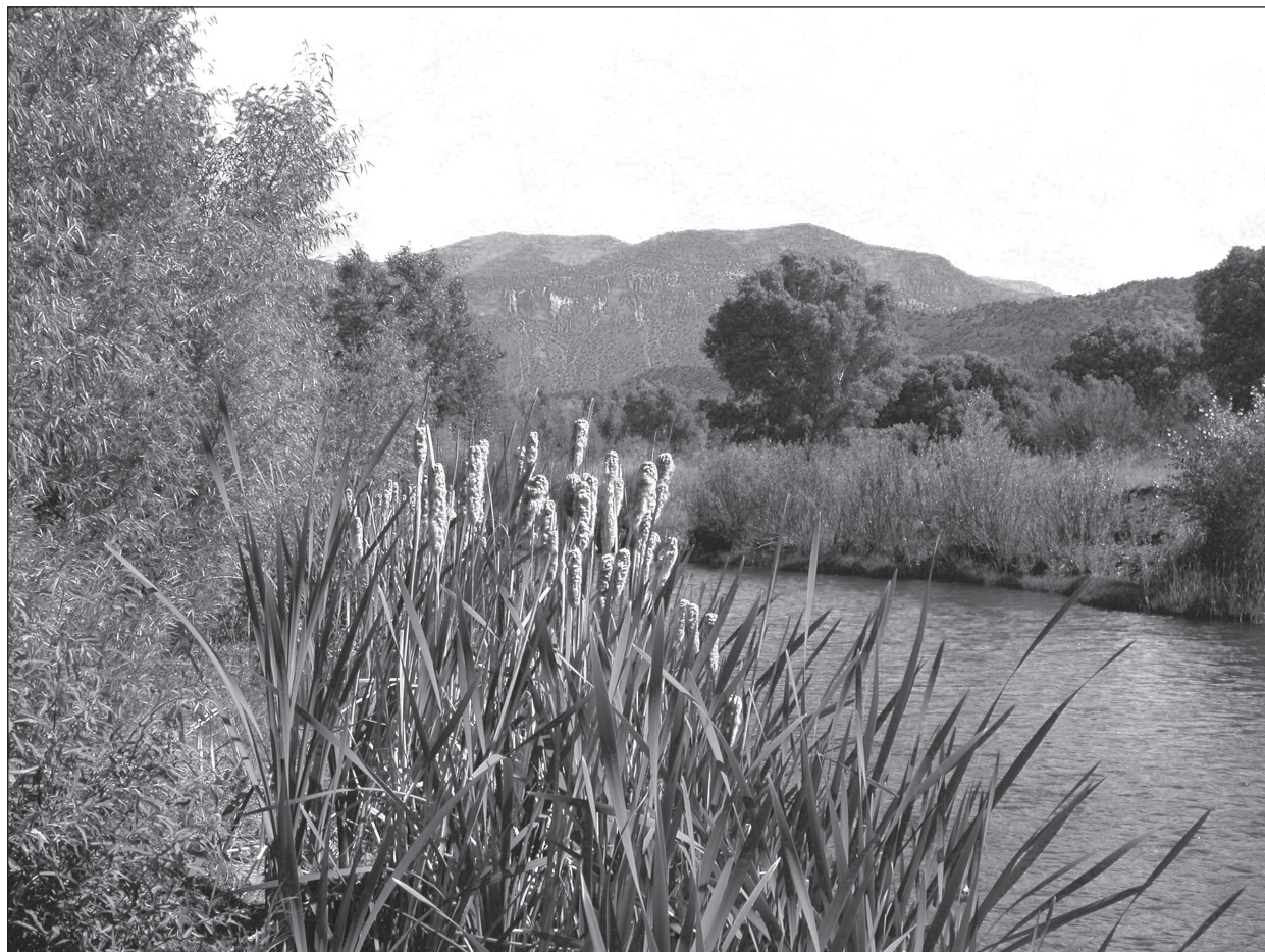
Tranquility on the Gila